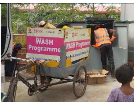
Solid Waste Management