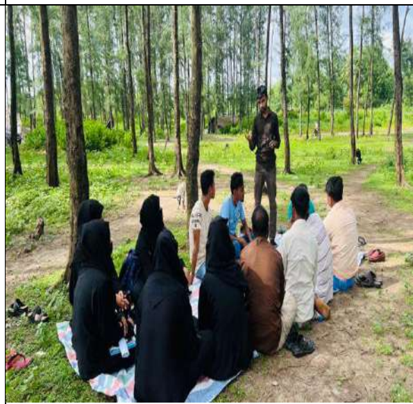
Growing of Dune Species Nursery at Red Crab Beach, Baillakhali, Ukhiya, Cox's Bazar.