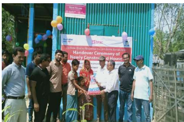
Inauguration of New House