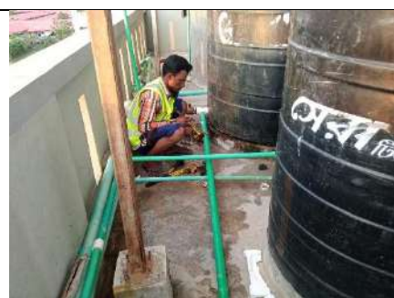
Repairing Water Networks