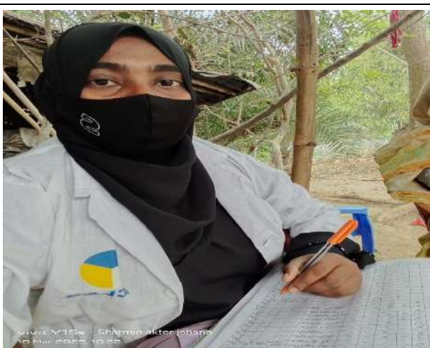
Household visit by Volunteer