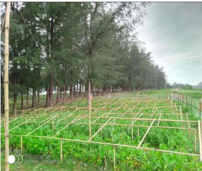
Nursery of Dune Species. It is only one nursery in Bangladesh.