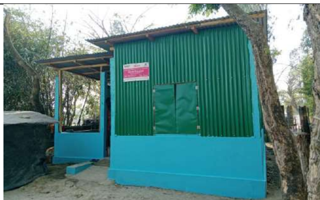
After (New House Construction for Cyclone Mocha affected people at Kutubdia, Cox's Bazar)