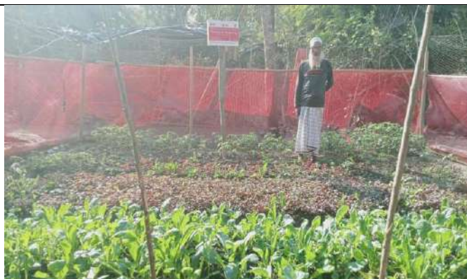
After getting support from Project