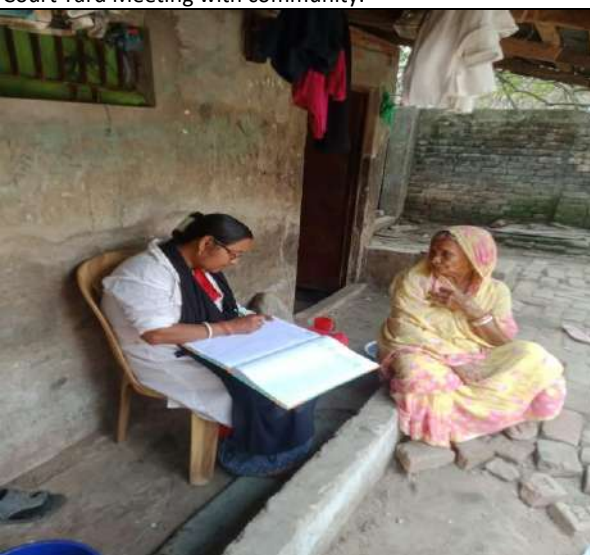
Household visit by volunteer