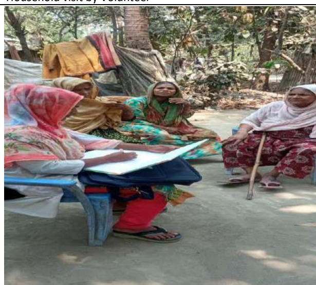
Court Yard meeting