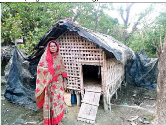
Before Goat Distribution