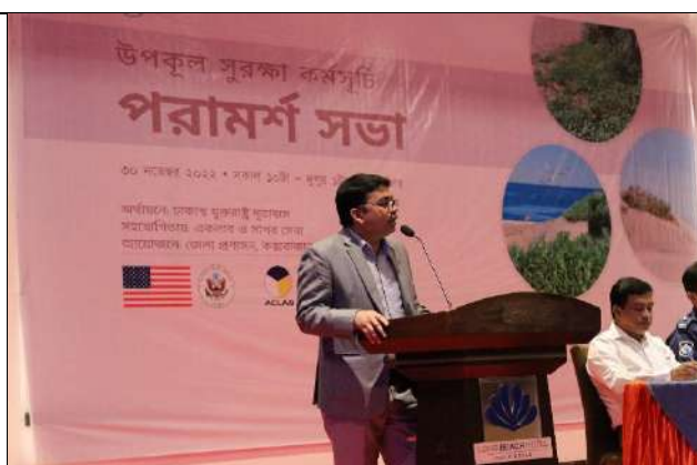
ADM of Cox's Bazar District Administration delivered speech in Consultation Meeting.