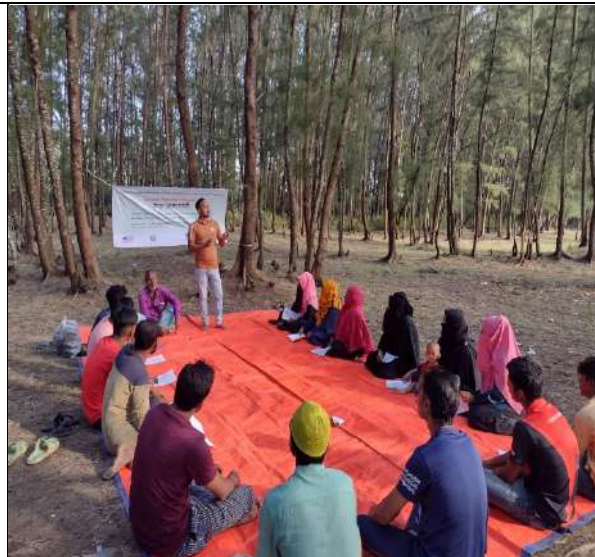
Youth Dune Restoration Committee Meeting