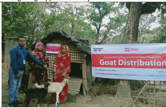
After getting Goat.