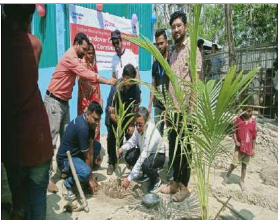
Inauguration of New House