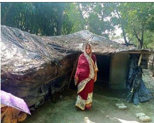
Before getting support