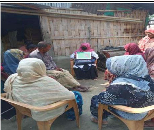
Court Yard Meeting with community.