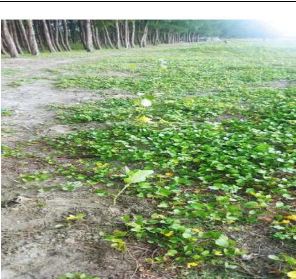
Restoration of Dune Forest at Baillakhali, Red Crab Beach, Ukhiya, Cox's Bazar