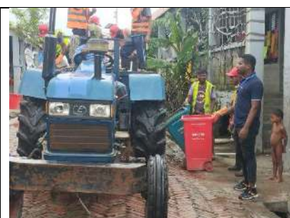
Solid Waste Management