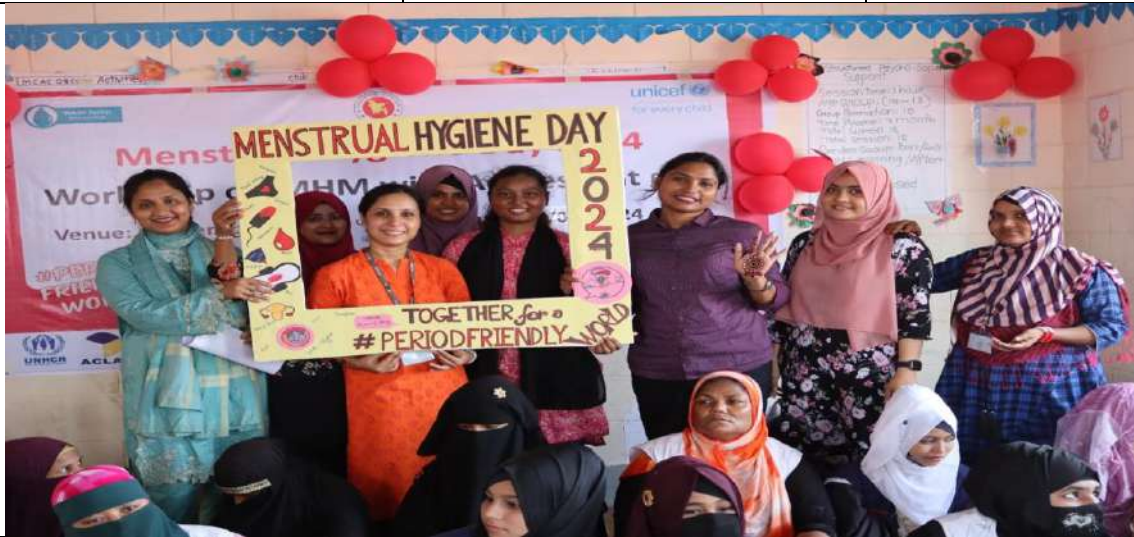
Observing Menstrual Hygiene Day 2024 at Cluster at Bhasanchar