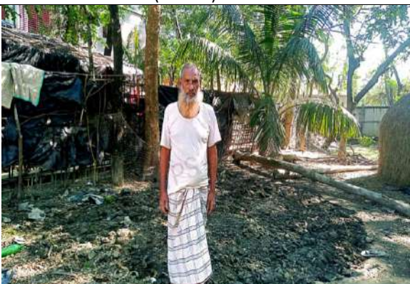
Before (Vegetable Gardening)