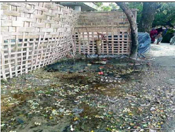
Tube-well Platform (Before)